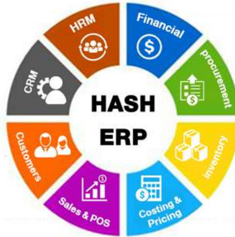
HASH ERP.PRO Product Modules